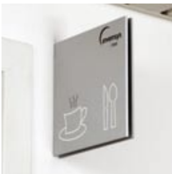
Projecting sign with pictogram

To mount a sign is easy. It is mounted on the hidden bracket by custom-made aluminium rivets that mesh with the grooves on the back of the sign.