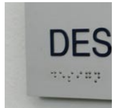
Wall sign with Braille