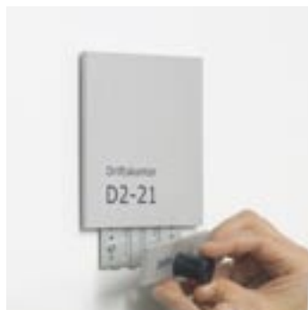
PlanSign magnetic lock system The locked sign is released by use of the magnetic key