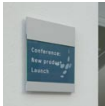
A5 Paperflex sign